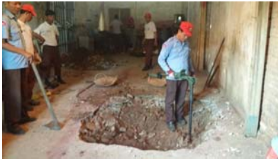
FERROUS locator VX1 in operation