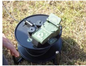
FERROUS locator VX1 used in borehole