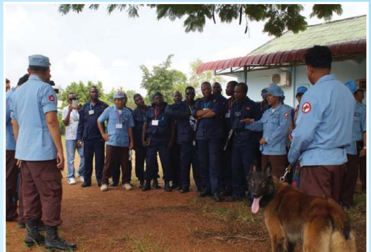
Angolan experts at the Dog Centre