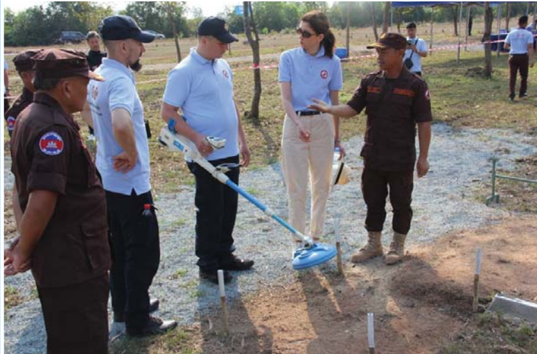
Ukrainian experts at the Technical Institute of Mine Action