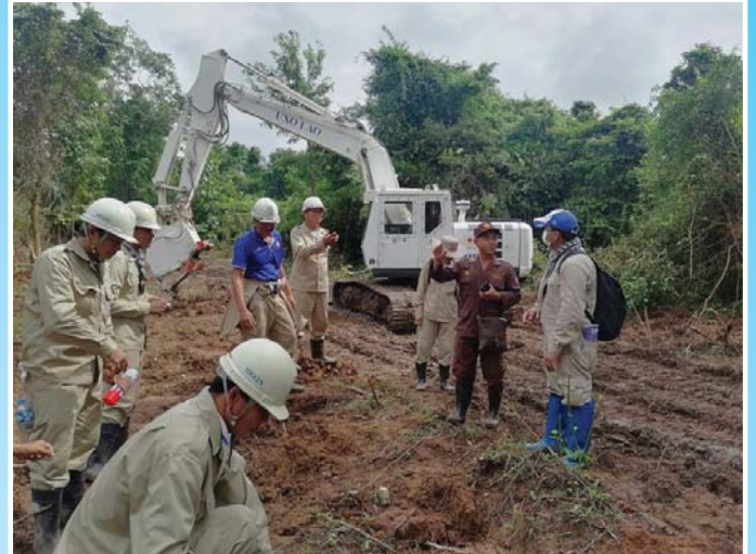
Lao experts at a training site