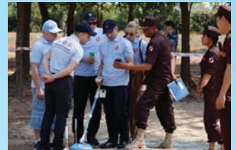
Training for Ukrainian Demining Personnel

Example: Demonstration test of a landmine burial location prediction system using AI (project in collaboration with a private company).