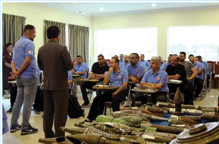
Iraqi experts at the Peace Museum of Mine Action