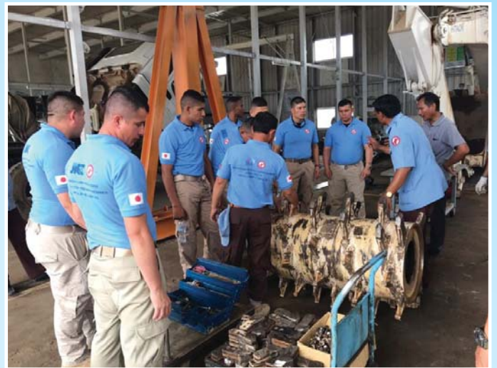
Colombian experts at the Central Workshop