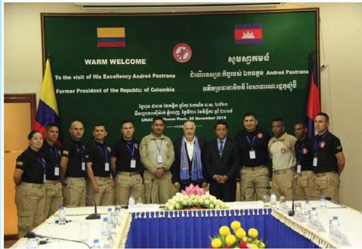
Colombian experts at the CMAC Headquarters