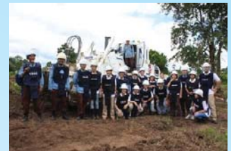
Training for Colombian demining personnel