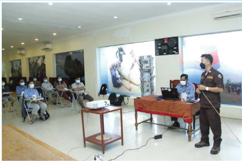
Burmese experts in the classroom