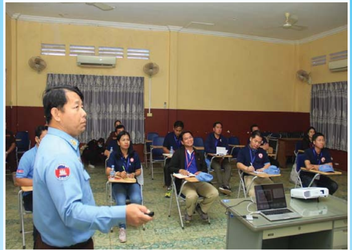
Lao experts at the Technical Institute of Mine Action